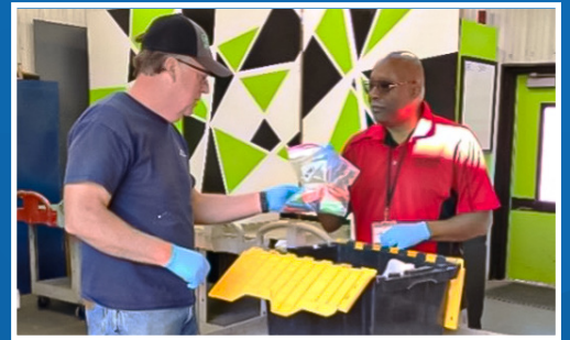
A customer carefully disposing of multiple e-cigarettes at an HHW collection site.