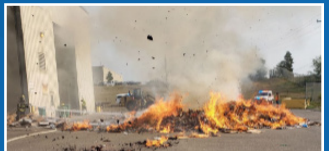
Firefighter extinguishing a lithium battery fire after the combusted pile of recyclables was moved outside by a municipal recycling facility operator.